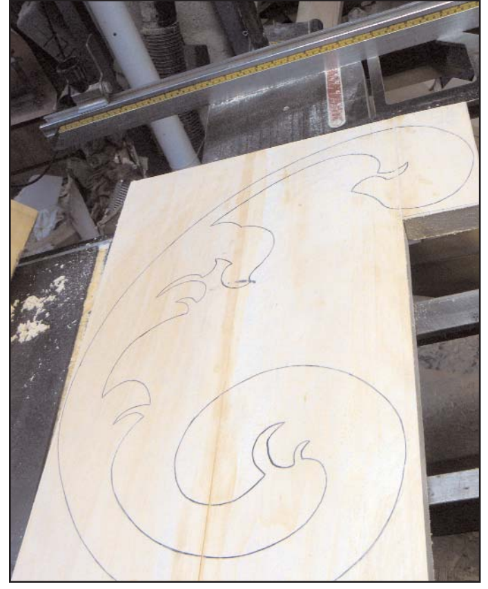
Figure 4. Glued-up pieces of basswood with patterns applied.

I found some terrific furniture grade maple plywood with no voids or patches one inch thick for the façade panels. The panels were laid out and rough cut slightly over size. The carved components were glued, traced and cut out on a band saw to the exact dimensions. Each piece had to be carved so that it mimiced the original Wurlitzer carvings.