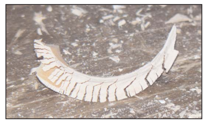
Figure 3. An example of brittle wood not giving crisp detail.

Now I needed wood. Being a bit finicky by nature, I wanted the best I could get. Tight growth rings take the best detail so that implied Northern grown. Most wood is available kiln dried, which I find to be brittle thereby not giving the crisp detail that I desire ( Figure 3 ). A trip to a friend who mills basswood from Northern Minnesota and Wisconsin was in order. I told him what I wanted, which they only cut in the winter when the sap is not running. I arrived and loaded up a truck. I like my stock to dry for at least a year, then plane and dimension it. Working with this type of wood yields crisp detail with nice chips.