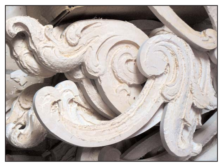
Figure 7. The end result of rough-cutting a band saw blank as seen in figure 6

I have a duplicarving machine that will carve a right and left hand carving from a single original master. I set up the right and left band sawn pieces next to the original master ( Figure 6 ). I had to rough out three sets of carvings for the set of three facades ( Figure 7 ). The roughouts were detailed and finished by hand ( Figure 8 ).