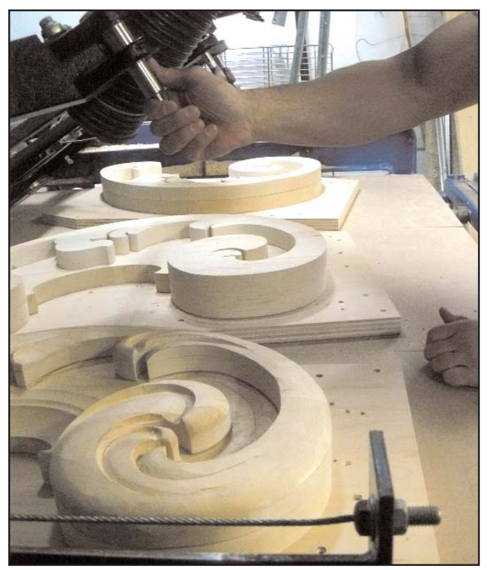
Figure 6. Using the duplicating machine to rough-carve the decorative scrolls.

needed Wurlitzer 165 carvings. This implied that the best approach was to carve a complete set of carvings to have as models.