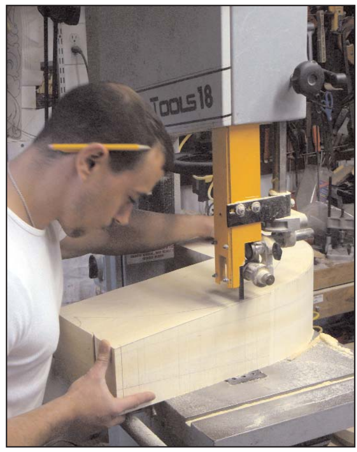
Figure 5. Using the band saw to rough cut the patterned wood.

It turns out that there are no two Wurlitzer 165 organs alike. I found the façade shapes to alter slightly, the placement of the carvings and the style of carving to differ dramatically. I suppose that the original customer had some say regarding the details. I also suspect that during the years that Wurlitzer made these instruments, the personnel in the factory changed.