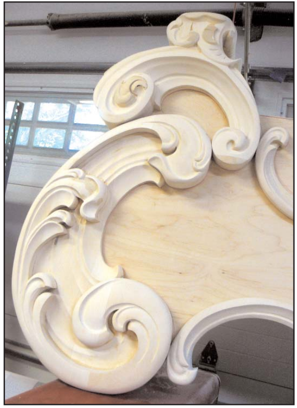
Figure 9. The finished carvings now applied to a façade section.